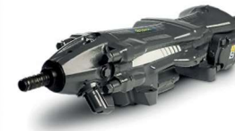
ROCK DRILL HAMMERS