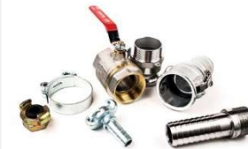
HOSES AND FITTINGS