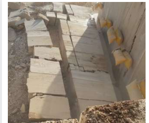
WATER AND AIR CUSHIONS