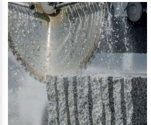
DIAMOND SAW BLADES