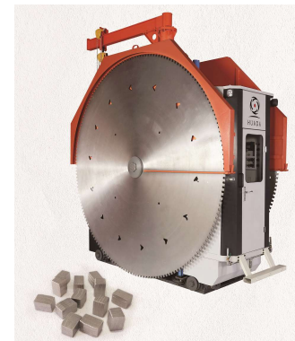
DOUBLE BLADE MACHINE - DBM