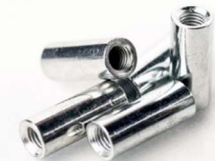
DIAMOND WIRE ACCESORIES