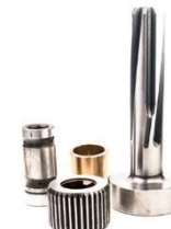
SPARE PARTS FOR ROCK HAMMERS AND DRILLING MACHINERY