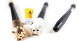
DRILLING EQUIPMENT/ TOOLS