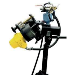
GRINDING MACHINES FOR INTEGRAL DRILL RODS AND BUTTON BITS