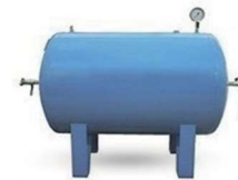
AIR TANKS (RECEIVERS)