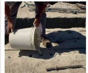
EXPANSIVE MORTAR (CRACKING AGENT)