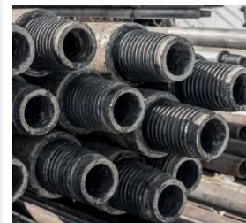
DRILLING PIPES DTH