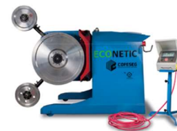
DIAMOND WIRE SAW MACHINES